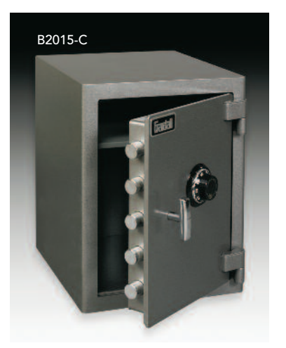
Five massive 1¼" bolts in boltwork